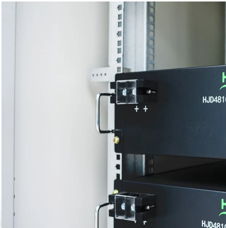
Photo of the transfer station equipment energy storage container