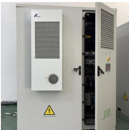
Vietnam Off-Grid Solar Energy Market (2025-2031) , Trends ...